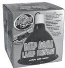
Deep Dome Lamp Fixture Item LF-17