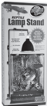
LF-20 REPTILE LAMP STAND