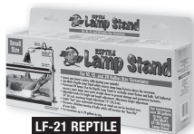
LF-21 REPTILE LAMP STAND