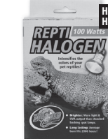
HB-100 REPTI HALOGEN LAMP