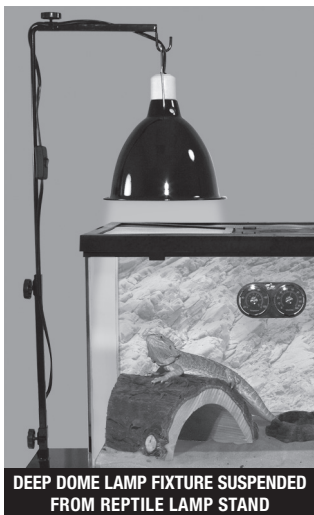
DEEP DOME LAMP FIXTURE SUSPENDED FROM REPTILE LAMP STAND